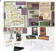
Anglo-Saxons Artefacts Pack

A big thank you to the 'Friends of St Mary's' to supporting us in the purchase of our new topic boxes: The Romans, Vikings, Anglo Saxons, Mayans, The Great Fire of London, Victorian Toys and more! The School as per our mission statement in striving for educational excellence and constantly seeking ways to enhance our teaching. The school spent £1500 on Science resources and £500 on Art and DT resources at the beginning of the year and we are now reviewing the resources for the humanities subject.