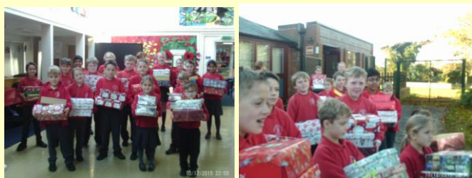
The children helping with the Shoeboxes for collection