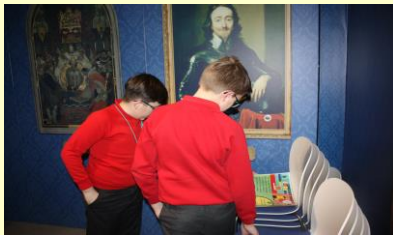
Year 6 Visit to The Houses of Parliament.

18 th March – Atomic Tom assembly + workshops