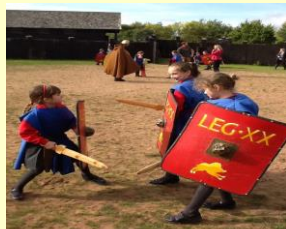
Juniper Visit to Hunt Fort

26 th November (Sunday) - The Feast of Christ The King