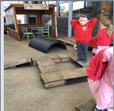
We really enjoyed our shape morning!