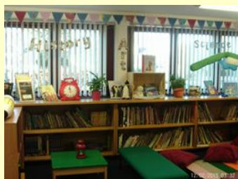
Our new look Library